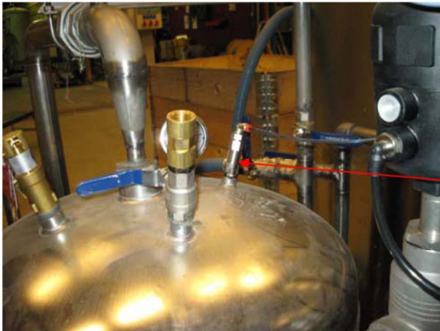
Non return valve #137 16101

We have experienced damaged to the air distributor in the electric cabinet caused by water penetration on some vessels. This has been caused by leakage of the non return valve #137 on the circulation tank #52. See picture below: