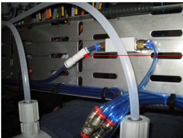
4mm non return valve 47206

In order to avoid and correct this problem Marinfloc recommend that the non-return valve is checked for leakage and replaced if necessary. Marinfloc also recommend that an extra non return valve is added to the hose after the air adjustment valve #136 for extra safety. See picture below: